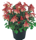
Rose & White AF0103R