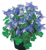
Blue & White AF0101R