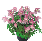
Pink & White AF0102R