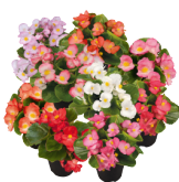
Maxi Mix BS0299P