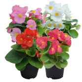
Mix (excl. Blush) BS0499P