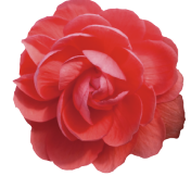
Salmon Pink BT0802P