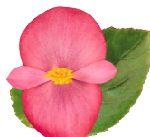
Rose Green Leaf BB0107P