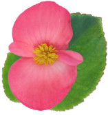
Deep Pink Green Leaf BB0113P