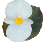
White Bronze Leaf BB0112P