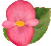
Rose Green Leaf BB0107P