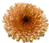
Red Buff CO0401R