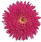
Carmines Red CC0406R