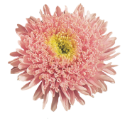
Light Pink CC0405R