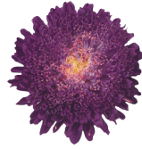
Deep Blue CC0402R