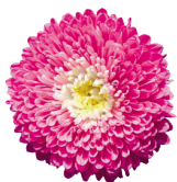
Carmines & White CC0409R