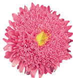
Salmon Pink CC0407R