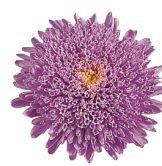
Light Blue CC0404R