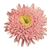
Light Pink CC0405R