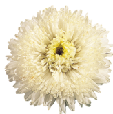
Creamy White CC0401R