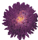
Deep Blue CC0402R