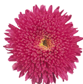
Carmines Red CC0406R