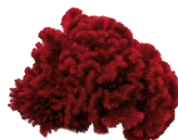
Raven Red CC4003R