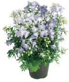
Blues ® DG0201R