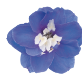
Mid Blue White Bee