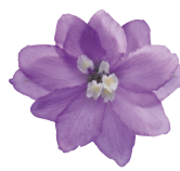
Lavender White Bee