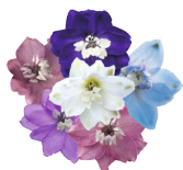
Crystal Mix DE0198R