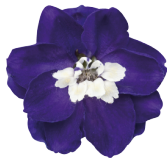
Dark Blue White Bee DE0102R