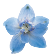
Sky Blue White Bee DE0106R