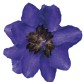
Dark Blue Dark Bee DE0101R