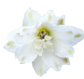
Pure White DE0109R