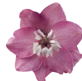
Lilac Pink White Bee