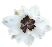
White Dark Bee