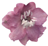
Cherry Blossom White