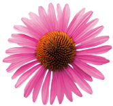
Deep Rose EP2001T