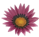
Rose Shades GR0202R