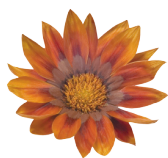
Red Shades GR0203R