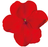
Cherry (Red) IW0105R