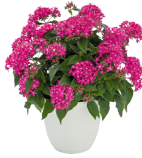
True Pink PL0407P