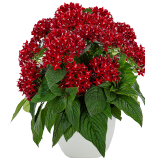
Deep Red PL0413P