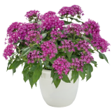
Ultra Violet PL0410P