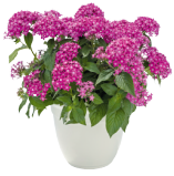
Lavender Pink PL0412P