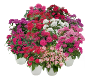
Maxi Mix PL0499P