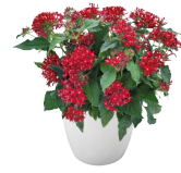
Red Velvet PL0422P