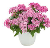
Flirty Pink PL0403P