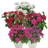
Selected Mix PL0498P