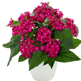
Neon Plum PL0415P