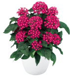
Bright Red PL0419P