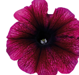
Plum Ice PH0313R/P