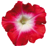
Red Morn PH0315R/P