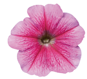
Strawberry Ice PH0320R/P