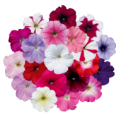
Regular Mix PH0399R/P