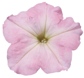
Chiffon Morn PH0307R/P