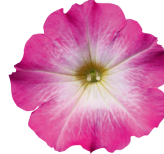
Pink Morn PH0312R/P