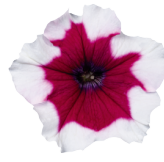
Burgundy Frost PH0304R/P