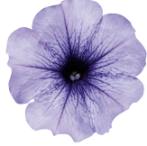
Blue Ice PH0302R/P