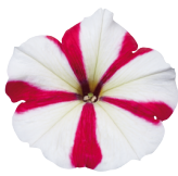
Rose Star PH0317R/P