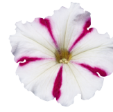
Burgundy Star PH0305R/P