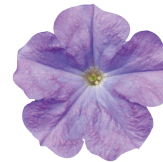
Sky Blue PH0319R/P