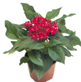
Deep Red PL0206P