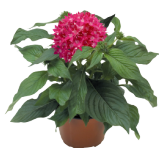
Deep Rose PL0203P