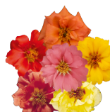
Peach Mix PG2295R/U