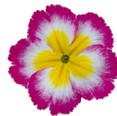
Rose Bicolor PE1109R