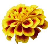
Yellow Fire TP0609R/C/D