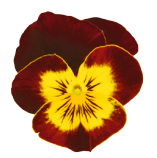
Red Yellow Face VC0121R/E