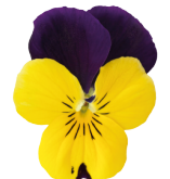
Yellow Purple Wing VC0117R/E