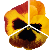
Fire Surprise VW0223R/E