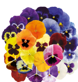
Maxi Mix VW0299R/E