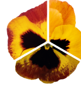
Fire Surprise VW0223R/E