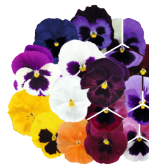
Maxi Mix VW0699R/E