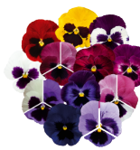
Blotch Mix VW0698R/E