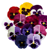
Blotch Mix VW0698R/E