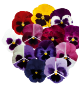
Blotch Mix VW0698R/E