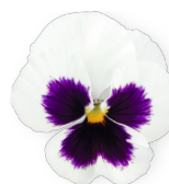
White Blotch VW0611R/E