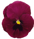
Deep Rose Blotch VW0607R/E