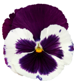
White Violet Wing VW0609R/E