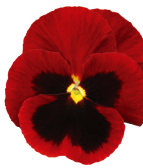
Red Blotch VW0605R/E