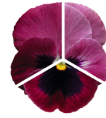
Light Rose Blotch VW0614R/E