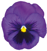
Blue Surprise VW0601R/E