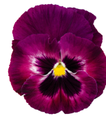
Rose Velour VW0608R/E