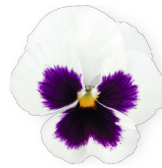
White Blotch VW0611R/E