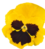
Yellow Blotch VW0613R/E