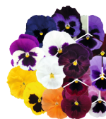
Maxi Mix VW0699R/E