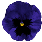
Deep Blue Blotch VW0602R/E