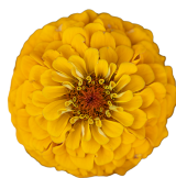
Golden Yellow ZE0201R