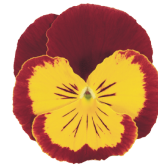
Red & Gold VW6007R