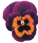
Poker Face VW6004R