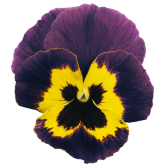
Violet & Gold VW6008R