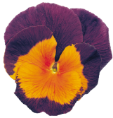
Jolly® Joker VW6005R