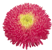
Bright Rose CC0306R