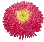
Bright Rose CC0306R