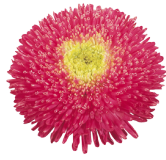
Bright Rose CC0306R