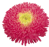
Bright Rose CC0306R