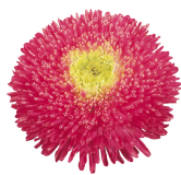
Bright Rose CC0306R