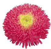
Bright Rose CC0306R