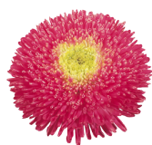
Bright Rose CC0306R