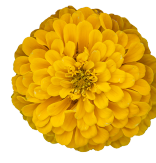
Golden Yellow ZE0405R