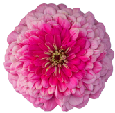
Bright Pink ZE0410R