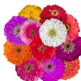
Mix (excl. Lime) ZE0499R