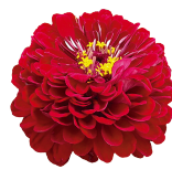
Deep Red ZE0407R