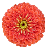
Salmon Rose ZE0402R