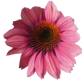
Pink Shades EP2104T