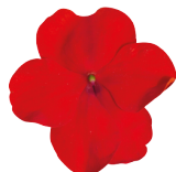
Cherry (Red) IW0105R