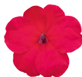
Dragon Fruit (Lipstick) IW0107R