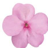
Pink Lemonade (Light Pink) IW0102R