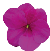
Raspberry (Violet) IW0110R