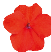
Tangerine (Deep Salmon) IW0109R