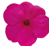
Fruit Punch (Rose) IW0106R