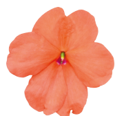
Peach (Salmon) IW0108R