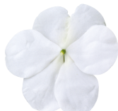
Coconut (White) IW0111R