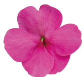
Bubblegum (Pink) IW0104R