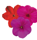
Fervent Fruit Mix IW0195R