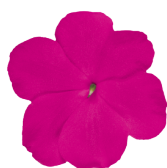
Pomegranate (Carmine) IW0101R