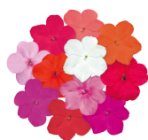
Maxi Mix IW0199R