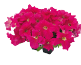
Deep Pink PH0513R/P