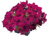
Burgundy IMPROVED PH0508R/P