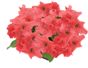
Deep Salmon PH0502R/P