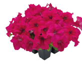
Deep Rose PH0504R/P