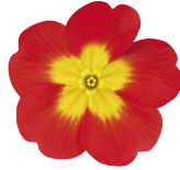
Bright Red PE1005E