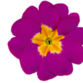
Rose Shades PE1006E