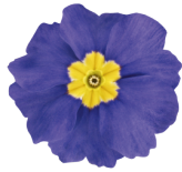
Blue Shades PE1002E