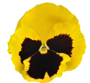
Yellow Blotch VW0207R/E