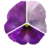
Lavender Blotch Shades VW0205R/E