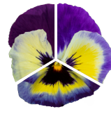
Blueberry Lemon VW0228R/E