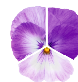
Marina Lavender VW0226R/E