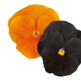
Jack-o-Lantern Mix VW0290E