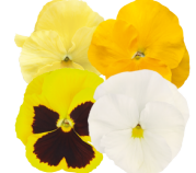
Limoncello Mix VW0294E