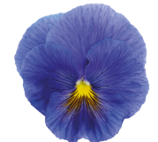
True Blue VW0210R/E