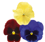
Wine Country Mix VW0291E