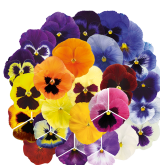
Maxi Mix VW0299R/E