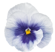
Metallic Blue Blotch VW0219R/E