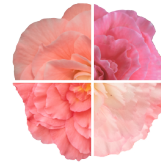
Light Pink Shades BT0513P