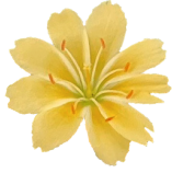
Golden Yellow LC0304T