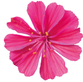
Ruby Red LC0301T