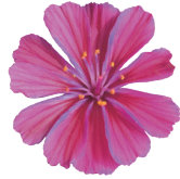
Ultra Violet LC0302T