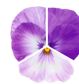
Marina Lavender VW0226R/E