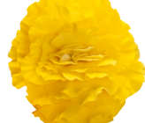
Yellow Red Back BT0405P