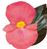
Rose Bronze Leaf BB0205P