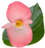
Pink Green Leaf BB0203P