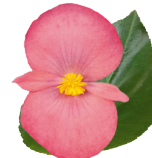
Rose Green Leaf BB0201P