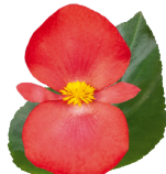
Red Green Leaf BB0202P