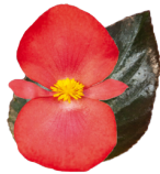
Red Bronze Leaf BB0206P