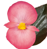
Salmon Bronze Leaf BB0209P