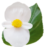
White Green Leaf BB0207P