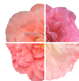
Light Pink Shades BT0513P