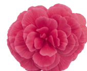
Pink Shades BT0507P