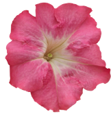
Salmon Morn PH0409P