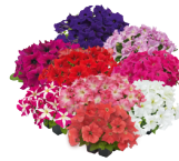
Maxi Mix PH0499P