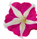
Rose Star PH0407P