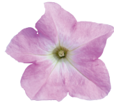
Light Pink PH0404P