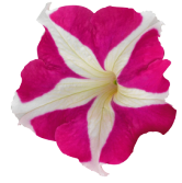
Rose Star PH0407P