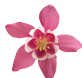
Rose & White AH0105R