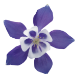
Blue & White AH0101R