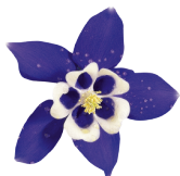
Navy & White AH0102R