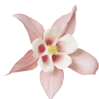
Pink & White AH0104R