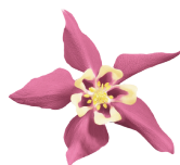
Rose & Ivory AH0106R